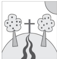
Ffederasiwn Dwy Afon